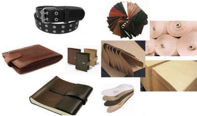
Tong Dynasty Material Ltd. Printing Consumables & Packaging Materials Zone Booth No.:6-E01