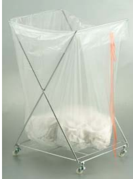
Union Grade Limited Packaging Services Zone Booth No: 3-E09