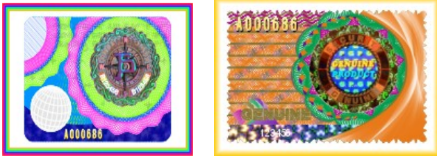
Jinda Holographic Printing Printing Services Zone Booth No: 3-B20