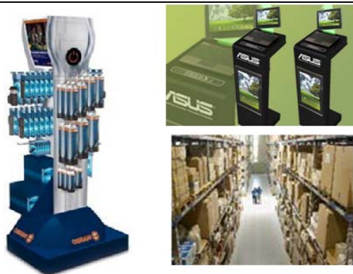
STI Asia Pacific Limited Packaging Services Booth No. 3-E16; 3-E18