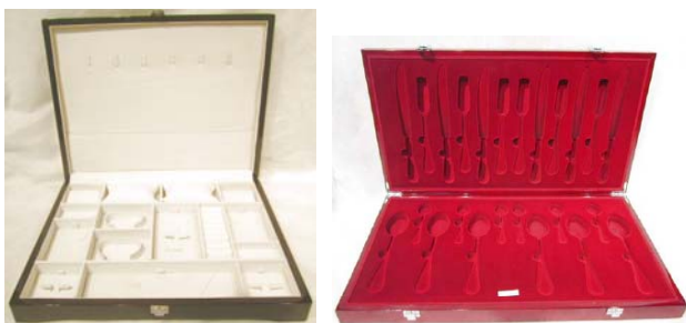
Hang Lee Packing Manufacturer Limited De Luxe Zone (New Zone) Booth No: 3-F04