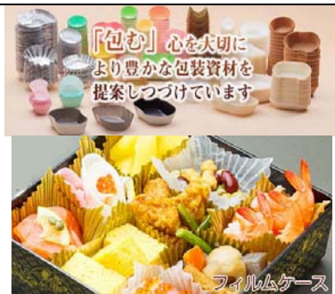
Shinmei Co., Ltd Food & Beverage Packaging Solutions Zone Booth No. 3-J26