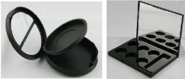
Noble Pacific Limited De Luxe Zone (New Zone) Booth No: 3-F03