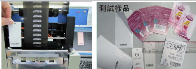
Feng Jia Supreme Barcode Company Limited Digital Printing Equipment Zone Booth No: 6-B12