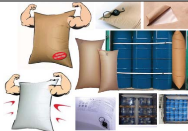
OEM SERV Hong Kong Limited Integrated Packaging Solutions Zone (New Zone) Booth No: 3-F16