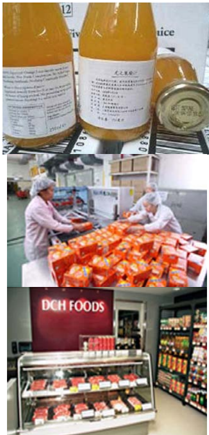
DCH Logistics Company Ltd. Integrated Packaging Solutions Zone (New Zone) Booth No: 3-F17