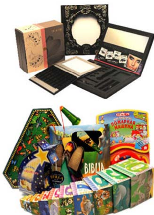
Chung Tai Printing (China) Co Ltd Printing Services Zone Booth No: 3-B07