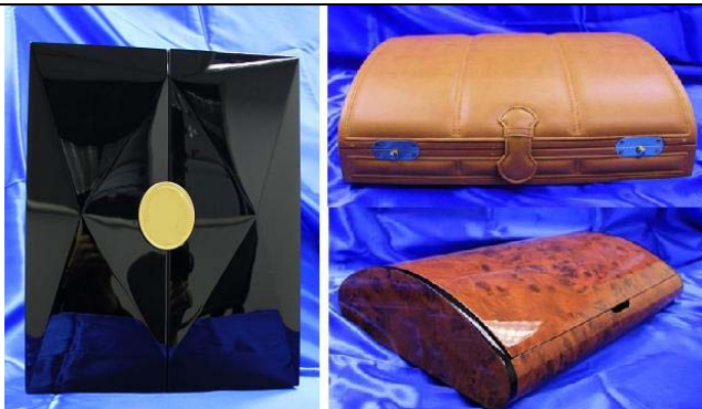
Sheer-On Industrial Ltd. De Luxe Zone (New Zone) Booth No: 3-F01