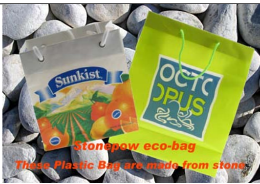
Chun Hing Plastic Packaging Mfy Ltd Packaging Services Zone Booth No: 3-E04