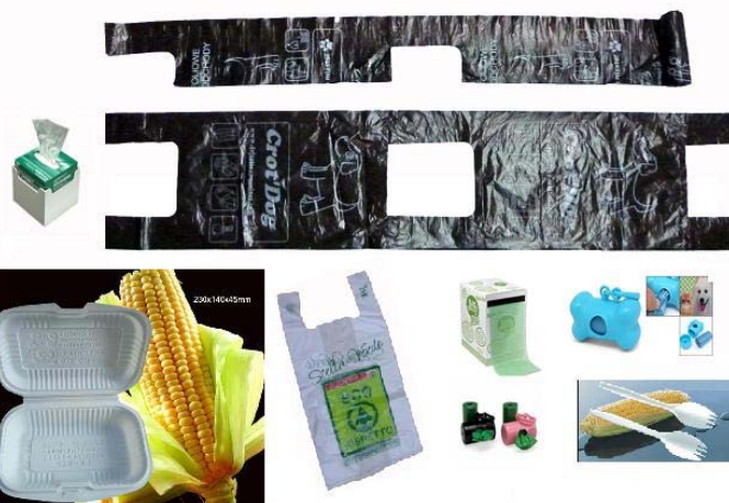
Rivon Plastic Color Printing & Packing (HK) Limited Packaging Services Zone Booth No: 3-E01