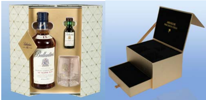
Shanghai Jingzhi Gift Packaging Co., Ltd De Luxe Zone (New Zone) Booth No: 3-F02